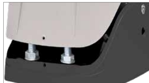
Hidden external case fixing

Electronic and mechanical parts well protected from weather conditions