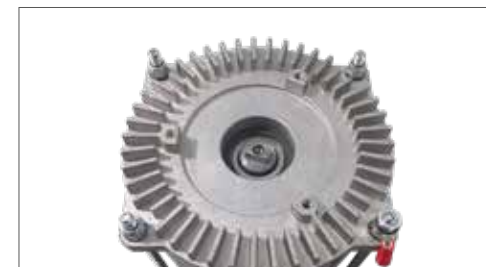
Sturdy and performing motors