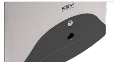
Aluminum polished base and rised fixing plate