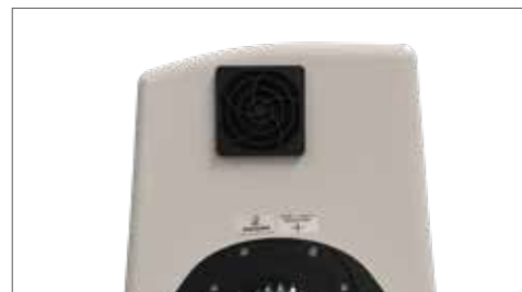
Cooling fan (SC202MHD) for intensive use